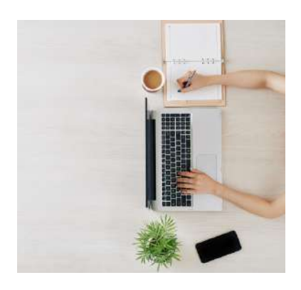
EU - Webinar: IP in Business collaborations for SMEs and Start-ups