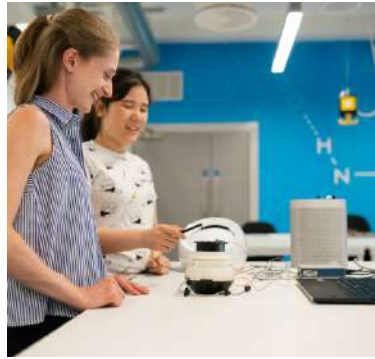
Women inventors make gains, but gender gaps remain