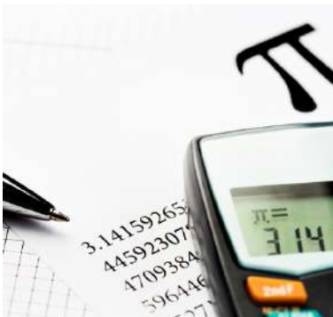
Pi Day Reflections: Absurdities in Intellectual Property Rights