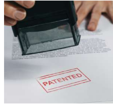
Innovation Around the World: The Latest Detection