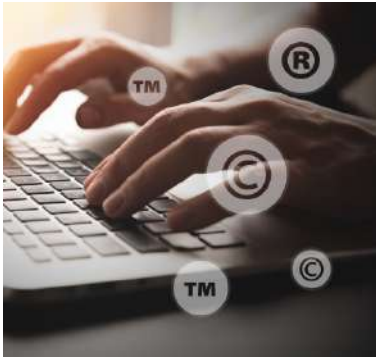
Copyright: Artworks entering the public domain in 2024