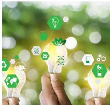
AI and IP: A Green Perspective