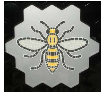
The Manchester bee: a symbol of hard work and... IPR?