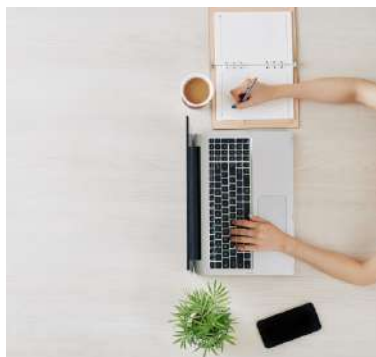
EU - Webinar: IP in Business collaborations for SMEs and Start-ups