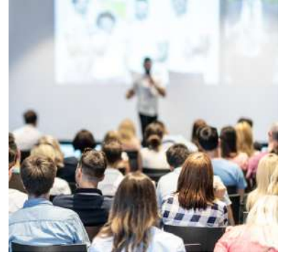
Green and digital transition - Challenge or opportunity_