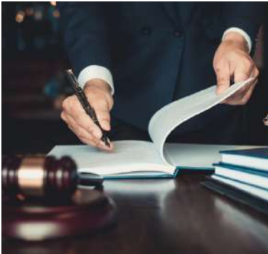
Made in Italy and intellectual property: the new law no. 206/2023