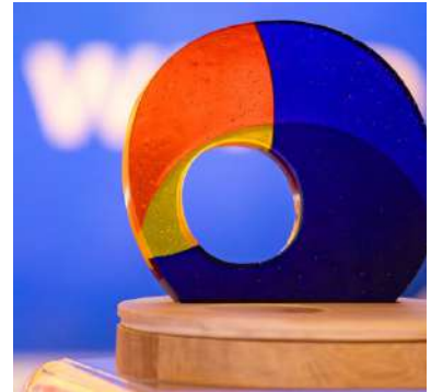
Call for awards for small and start-up companies that successfully use intellectual property.