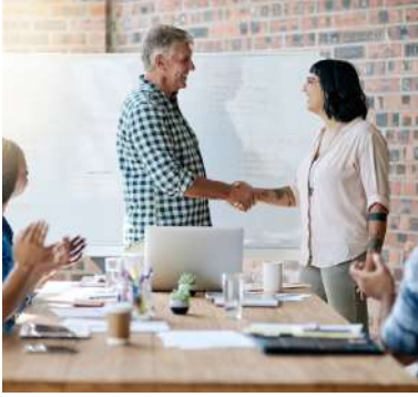
Driving Circular Transformation: Inspiring Success Stories Across Europe