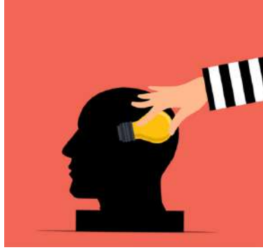
Safeguarding IPR in Croatia: A brief Overview of 2022