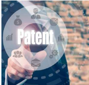
Weird and Wonderful Patent Picks